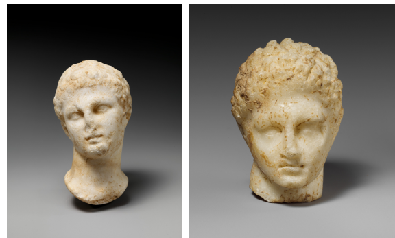
Ill. 1. Marble head of a youth, Hellenistic period, 3 rd century BC, marble, H.: 14.5 cm. The MET, New York, inv. no. 10.210.23.