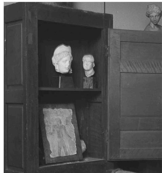
Ill. 8. Brummer Frères - Brummer Curiosités, Paris, 16 May 1940.