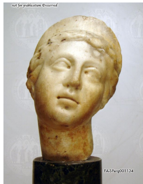
Ill. 5. Head of a young man, Hellenistic, 1 st century BC, marble, H.: 11.5 cm. Antikensammlung, Berlin, inv. no. sk558.