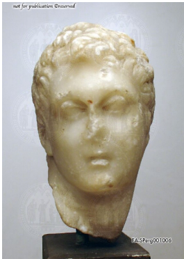
Ill. 4. Head of a young man, Greek, 3 rd or 2 nd century BC, marble, H.: 7.5 cm. Private collection.